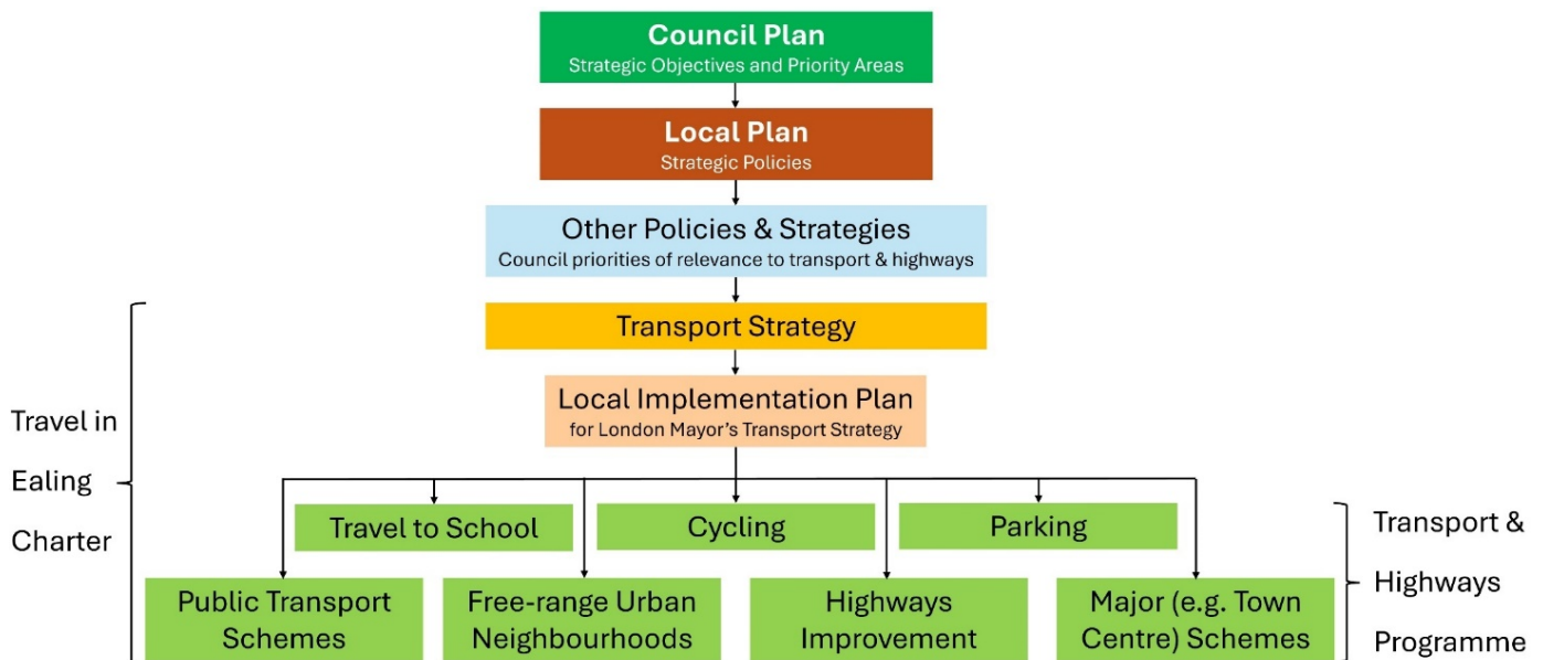
Strategic Objectives to Transport Programmes Flow Chart

2.9 While the new Transport Strategy is being prepared, the Local Implementation Plan (LIP) Three Year Plan 2022-25 sets out the ambitions and targets required to meet the goals of the Mayor’s Transport Strategy and provides the rationale for the Council’s spending decisions. The Council’s transport priorities are to encourage sustainable travel in response to over-arching environmental, safety, economic, public health, and social priorities, which are reflected in the LIP and will be captured in the new Transport Strategy.